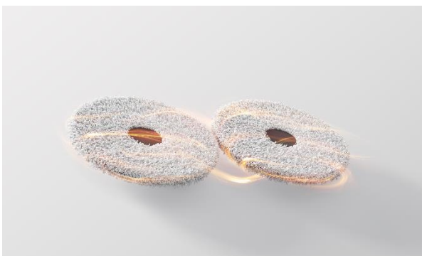
Hot air mop drying