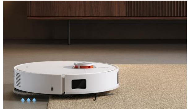
Carpet detection & Auto-lifting mop pads