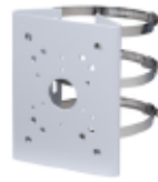
A36 Pole Mount