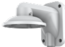
A25 Corner/Pole Mount