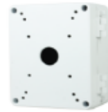
811 Junction Box