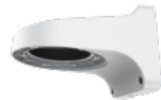
A28 Wall Mount