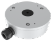
TC-P54BM Spec: V1 Junction Box