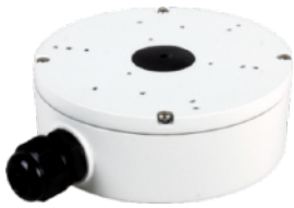
A22 JUNCTION BOX