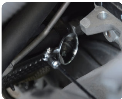
38 mm Diameter Inspection Mirror

To inspect hidden or narrow areas Double ball joint links swivel mirror for viewing to 360°