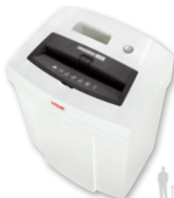
5 HSM SECURIO C14