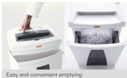
Easy and convenient emptying.