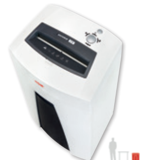
7 HSM SECURIO C18