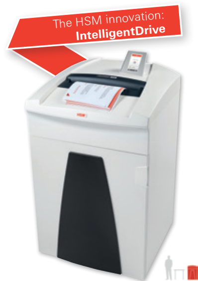
14 15 16 HSM SECURIO P36i/P40i/P44i