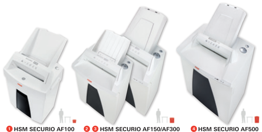
1 HSM SECURIO AF100 2 3 HSM SECURIO AF150/AF300 4 HSM SECURIO AF500

Hinged magazine for paper stacks, HSM SECURIO AF300 and AF500.