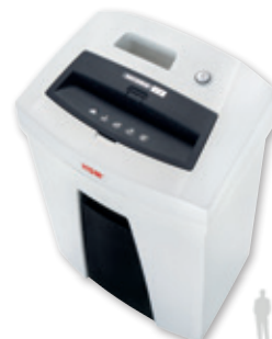
6 HSM SECURIO C16