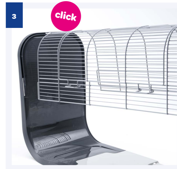
Click now the wire cage part into the side panel. Make sure it is well fixed. Take now the remaining side panel and assemble this to the cage and the connector.