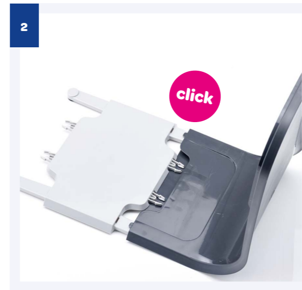
Take 1 of the 2 side panels and attach to the connector.