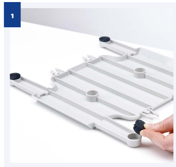
Assemble the 4 non-slip feet below the connector.