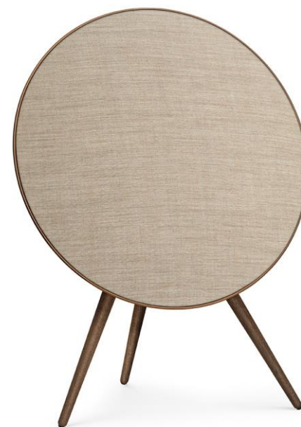
BRONZE TONE SPECIAL EDITION