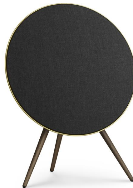
SMOKED OAK SPECIAL EDITION (MONOBRAND ONLY)