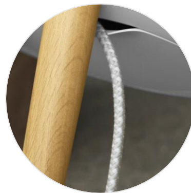
FABRIC POWER CABLE