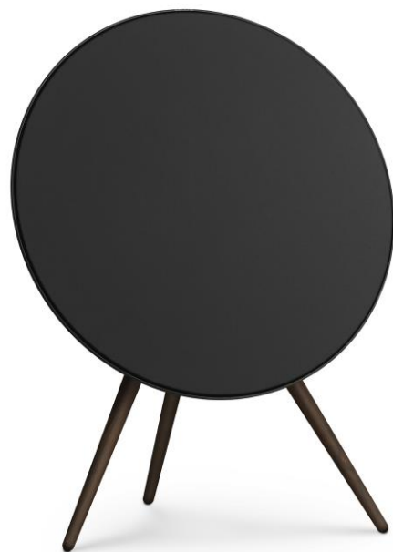
BLACK WITH BLACK WALNUT LEGS