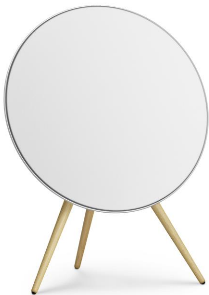
WHITE WITH OAK LEGS