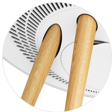
OAK LEGS (WHITE VERSION)