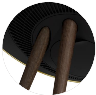
BLACK WALNUT LEGS (BLACK VERSION)