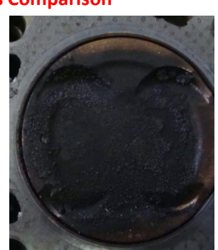
Industry Standard Engine Oil