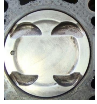
MAGMA SYN PSA 5W-30