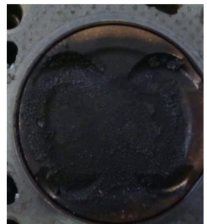
Industry Standard Engine Oil