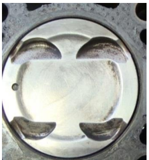
MAGMA SYN PSA 5W-30