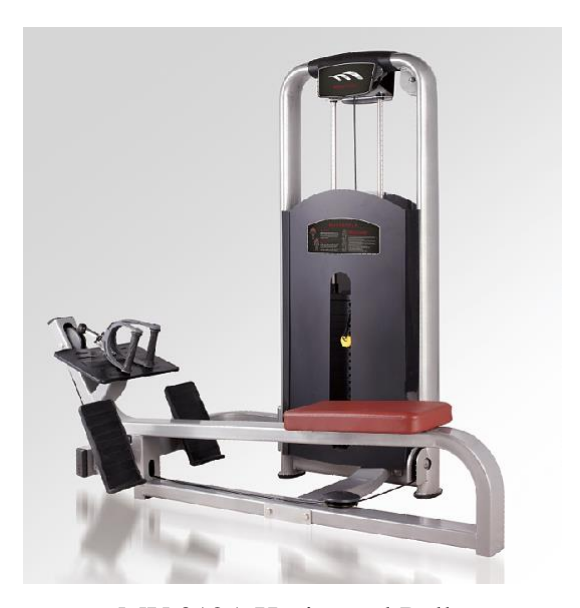
MV-012A Horizontal Pully

Exercise Part: Shoulder Back Trapezius, Latissimus Dorsi, Biceps Brachii