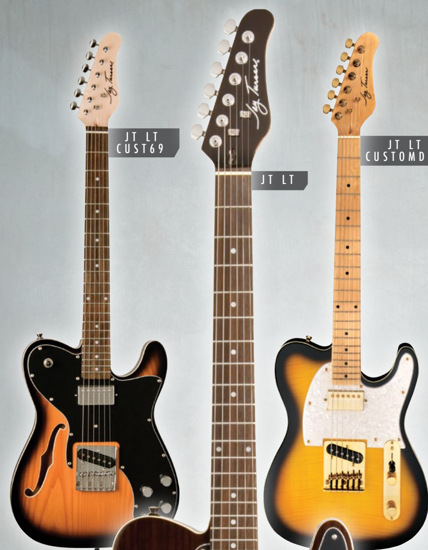
JT LT CUST69