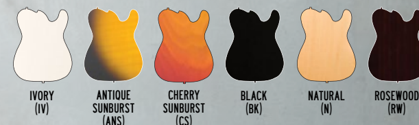
IVORY (IV) ANTIQUE SUNBURST (ANS) CHERRY SUNBURST (CS) BLACK (BK) NATURAL (N) ROSEWOOD (RW)