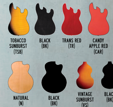
TOBACCO SUNBURST (TSB) BLACK (BK) TRANS RED (TR) CANDY APPLE RED (CAR) NATURAL (N) BLACK (BK) VINTAGE SUNBURST (VS) BLACK (BK)