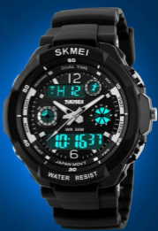
EL LIGHT DISPLAY MODE