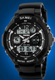
NORMAL DISPLAY MODE